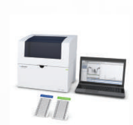
Agilent 4200 TapeStation System

The Agilent 4200 TapeStation system provides true end-to-end sample quality control within any next generation sequencing, microarray or qPCR workflow. The system offers walk away operation with fully automated sample processing. For the complete DNA and RNA assay portfolio, analyze 1-96 samples at a constant cost per sample. Ready-to-use ScreenTape technology enables ultimate flexibility for switching between assays in no time.