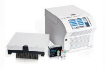
Agilent SureCycler 8800

The SureCycler 8800 Thermal Cycler provides users with a complete package of market leading features and functionality. This PCR machine can run even the most complex thermal cycling techniques including time and temperature increments, touchdown PCR, and temperature gradients.