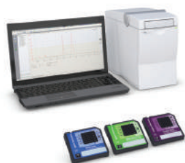
Agilent 2100 Bioanalyzer System

The Agilent 2100 Bioanalyzer System is an established automated electrophoresis tool for DNA and RNA quality control and ensures your sample is of the highest integrity in only 30-40 minutes.