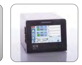
An optional gas-control unit is available for cell-based assays.